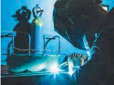
MIG welding of aluminium

The high-performance gas shielding solution for TIG and MIG welding of all materials