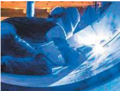
TIG welding of stainless steel