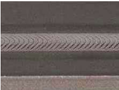
Plasma welding of titanium